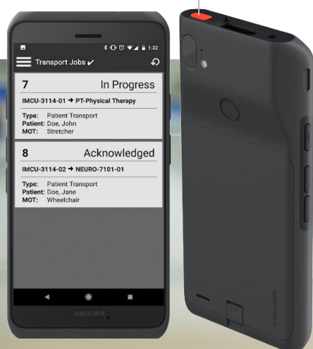
Alarm button (red)