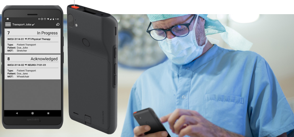
Alarm button (red)

Spectralink SAFE also protects clinicians with access to security at the touch of a red button at the top of the device.